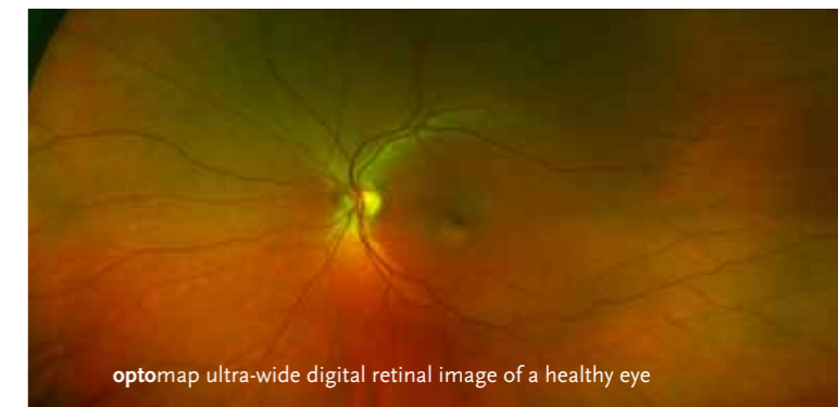
optomap ultra-wide digital retinal image of a healthy eye